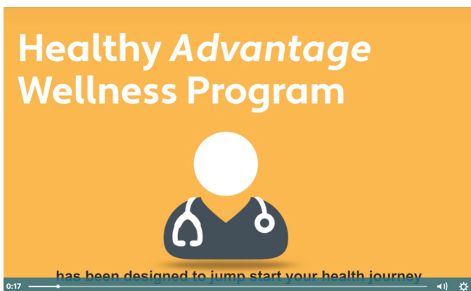
Get rewarded with your Healthy Advantage Wellness Program