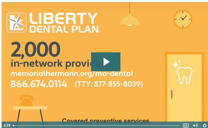
Find all you need to know about the Liberty Dental Plan

We want to make sure your clients are getting the most out of the Memorial Hermann Advantage Plan, so we've developed a few videos that will help them find new ways to make their member experience better.