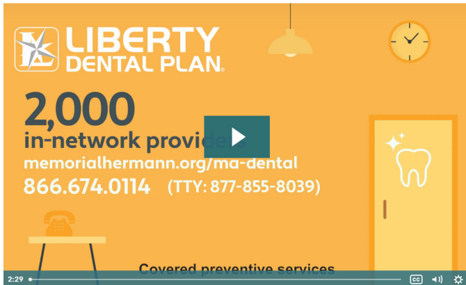
Find all you need to know about the Liberty Dental Plan

We want to make sure your clients are getting the most out of the Memorial Hermann Advantage Plan, so we've developed a few videos that will help them find new ways to make their member experience better.